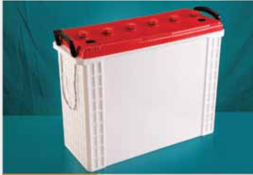
IT 500 (OT) 505 x 190 x 378