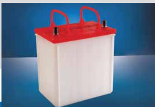
NS 40 197 x 127 x 200