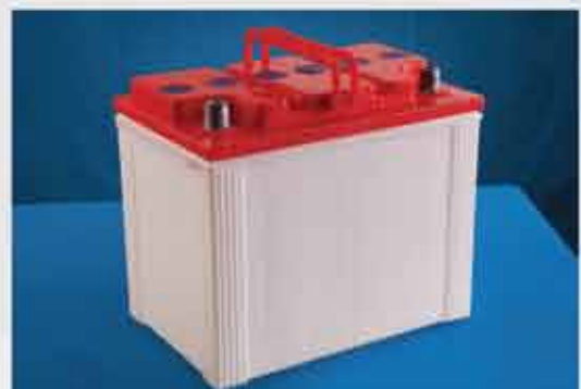
N 50 270 x 172 x 223