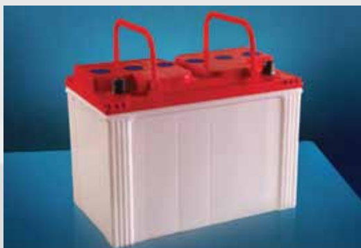
N 70 300 x 171 x 223