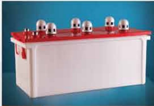
N 150 514 x 212 x 215