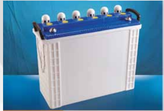
IT 500 (HST) 505 x 190 x 378