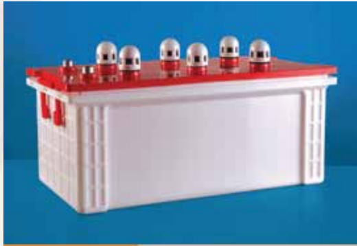
N 200 (HST) 515 x 273 x 217