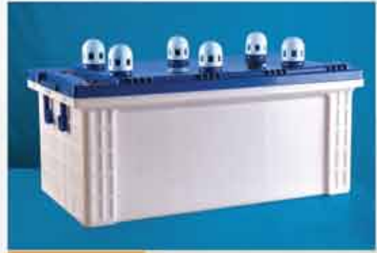
N 200 (OT) 515 x 273 x 217